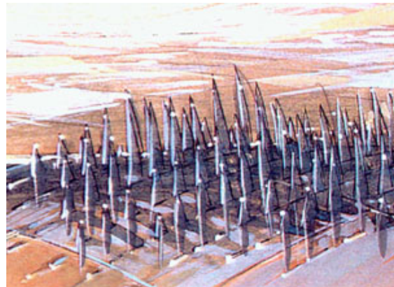
Left: Here's a settlement (illustration by Mark Tedin) of white-aligned humans, the Aurioks. Aurioks are wiry and resourceful (see Auriok Steelshaper ) -- their construction appears more makeshift than the Leonin den. This illustration features a lookout tower on top of the building, and on the right, a "tuft" of razor grass.